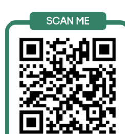
Food Bank Donation