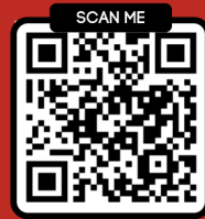
PSJ Main Campus