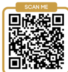
Volunteer Sign Up