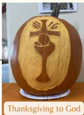
Thanksgiving to God