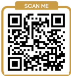
PSJ-VIS-SR Sacrificial Giving

The Sunday collection is very important for us to maintain our fiscal responsibilities. So, if you are away on a Sunday, ENJOY; but, remember YOUR church. Set up your gift today or consider an additional gift via our Online Giving at QR Codes below: