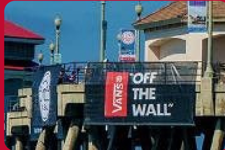
HB PIER BANNERS 3' X 20'