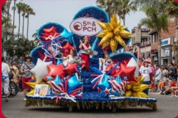
BRANDED PARADE FLOATS & VEHICLES