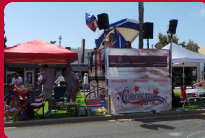
PARADE SIGNS & BANNERS