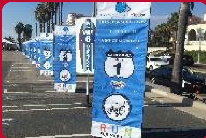
5K COURSE SIGNAGE