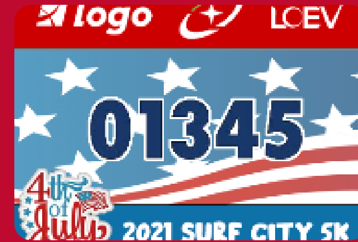
5K RACE BIB LOGO