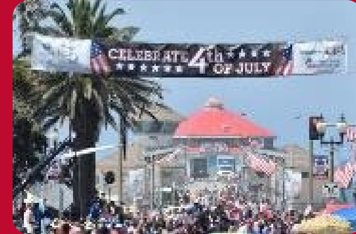
OVERHEAD STREET BANNERS 4 HIGH VISIBILITY LOCATIONS