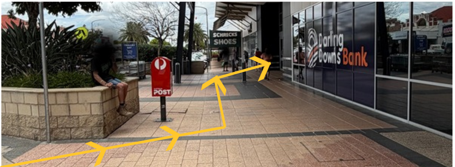
ENSURE NO PEDESTRIANS - ENTER UP ON TO THE FOOTPATH AND DRIVE SLOWLY TOWARDS THE MAIN CUNNINGHAM STREET ENTRANCE - KEEP LEFT OF THE CENTER BOLLARD.