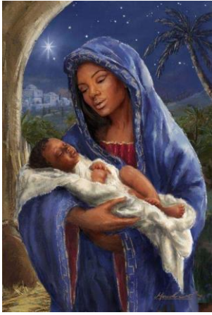
Joy to the World