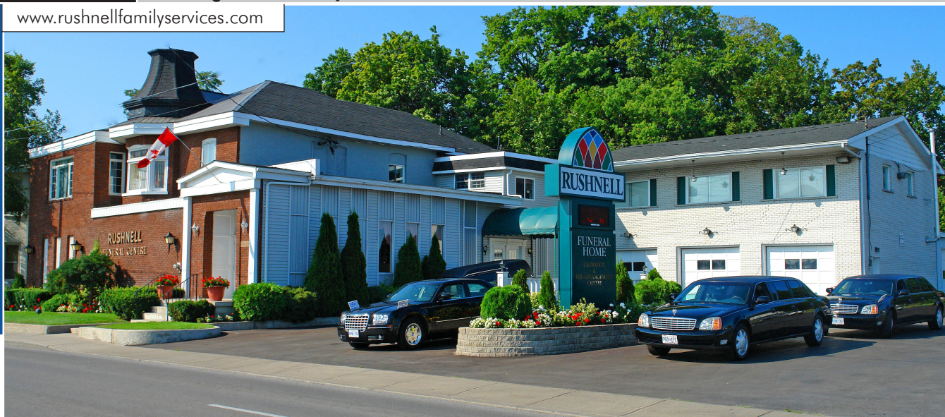
Rushnell Funeral Centre located in Trenton, Ont.