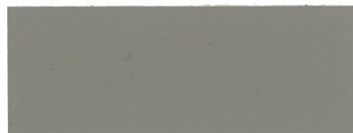
Gun Metal Light 1 Bag/2 Yards