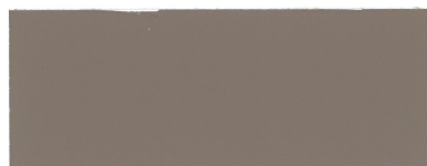
Chocolate Medium 1 Bag/1 Yard