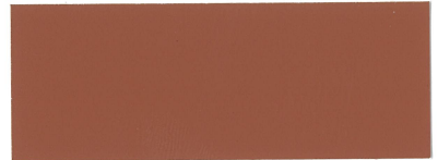
Watermelon Dark 2 Bags/1 Yard