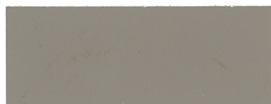
Chocolate Light 1 Bag/2 Yards