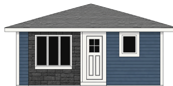
Springfield - Hipped Roof