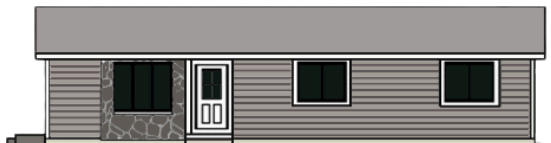
Jefferson - Gable Roof

Determines roof line configurations - Hipped or Gable rooflines available on ALL models