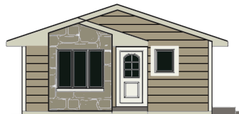
Springfield - Gable Roof