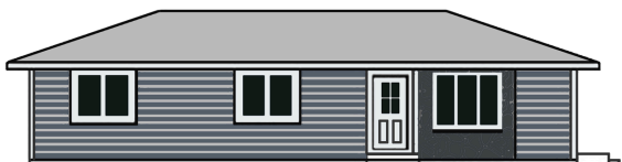
Perry - Hipped Roof