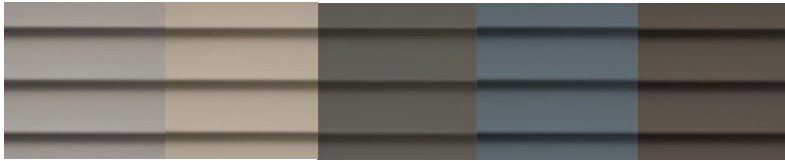
Granite Gray Natural Clay Smoky Gray Pacific Blue Espresso