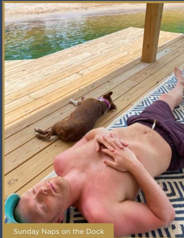
Sunday Naps on the Dock