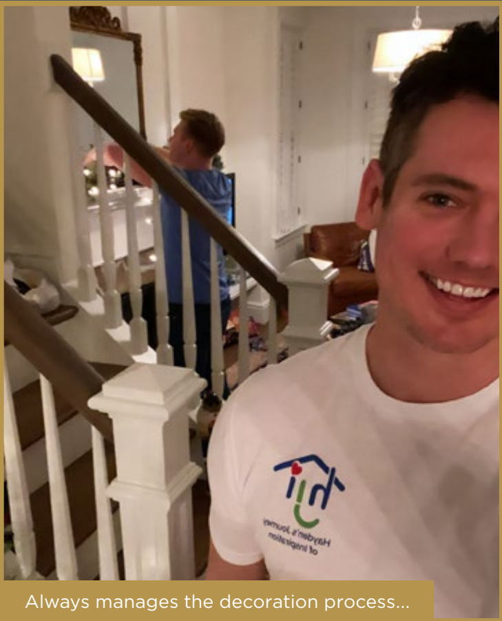
Always manages the decoration process...