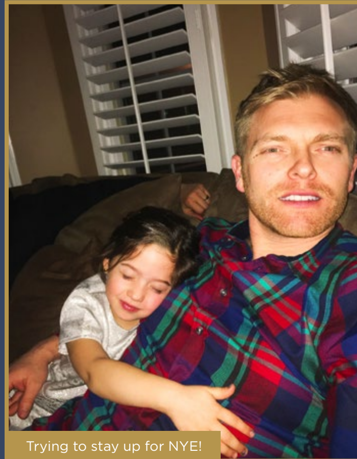
Trying to stay up for NYE!