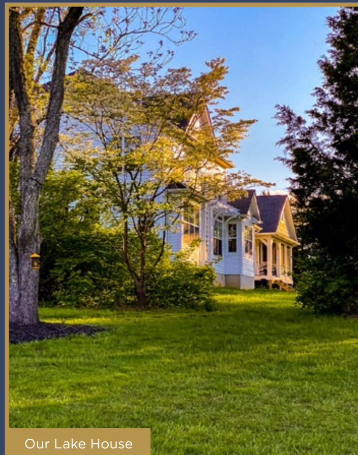
Our Lake House