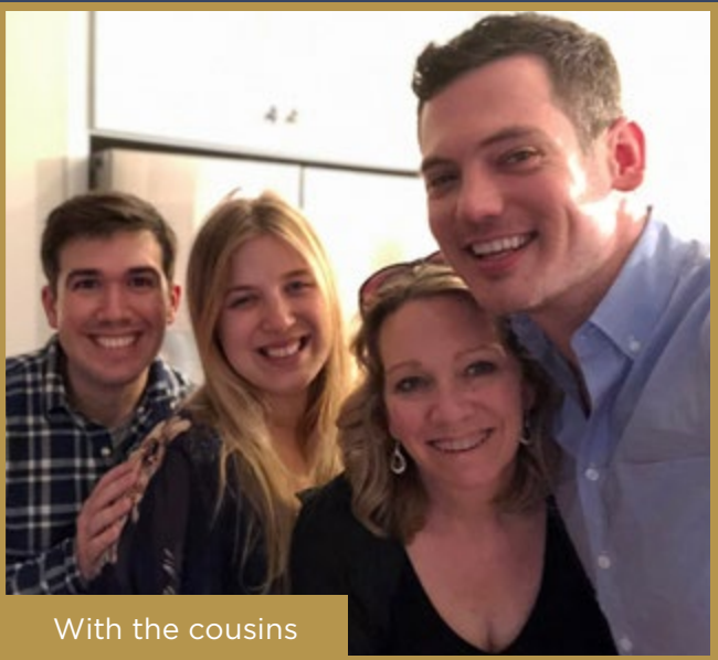
With the cousins