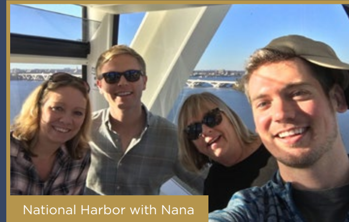
National Harbor with Nana