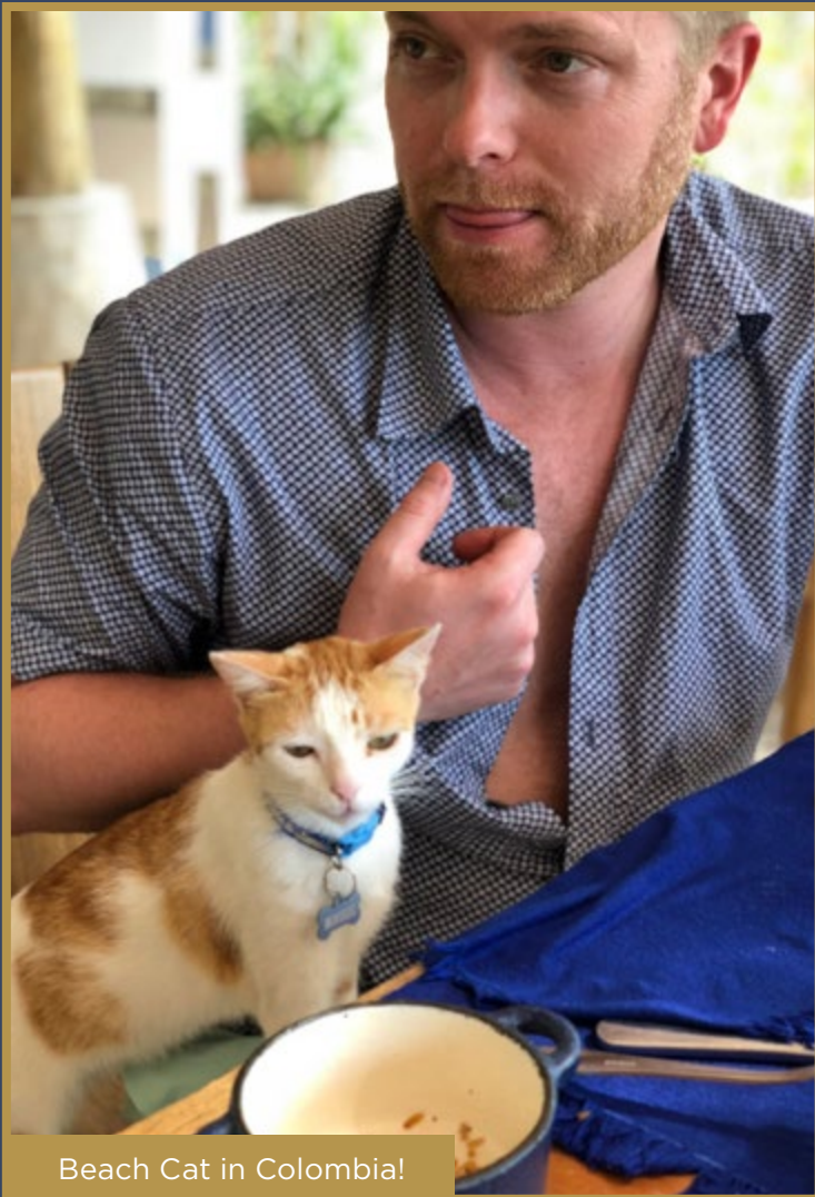
Beach Cat in Colombia!

Now, looking ahead, I cannot wait to share these passions with a child. I'm excited to help them learn about the beauty of music, and to sing their favorite songs around the piano. I also look forward to teaching them to appreciate the rewards and satisfaction that comes with thinking through a problem and finding a solution.