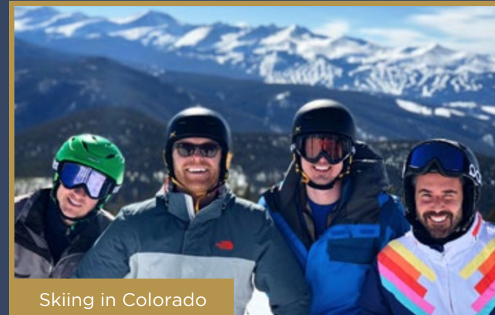
Skiing in Colorado