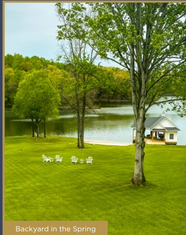
Backyard in the Spring