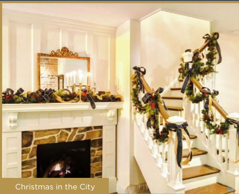
Christmas in the City

Whether we're in DC or down at the lake, we've built a safe, comfortable, fun, and loving home life that we cannot wait to share with a child.