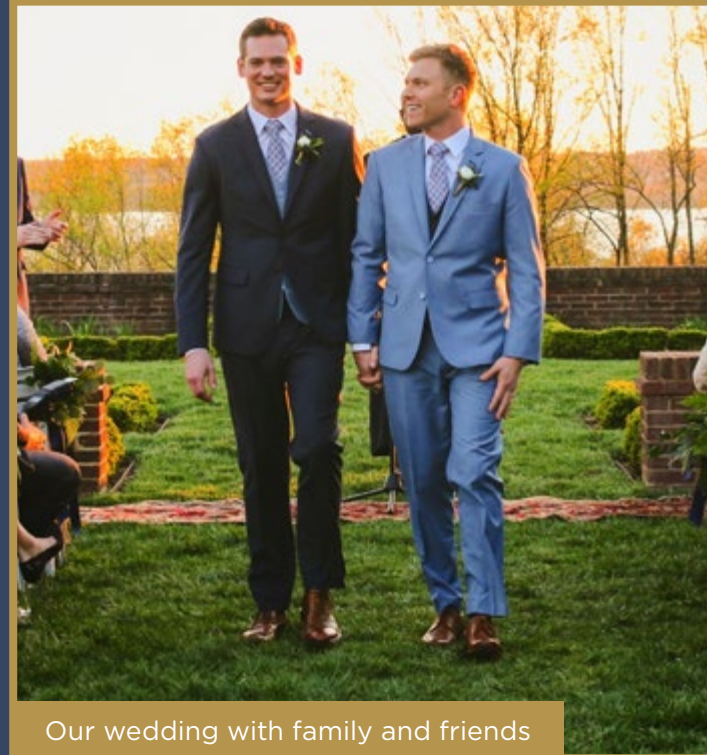
Our wedding with family and friends