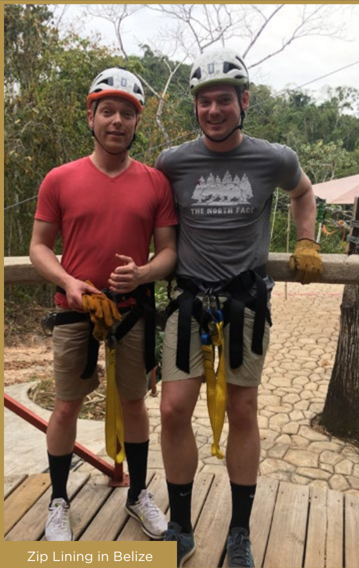
Zip Lining in Belize