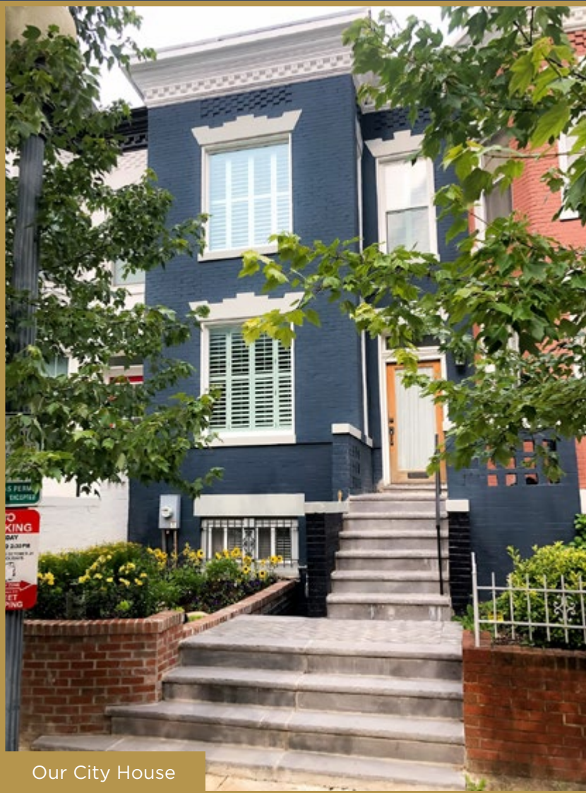
Our City House