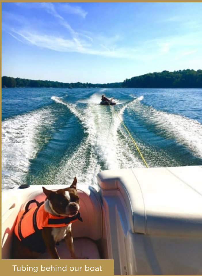
Tubing behind our boat