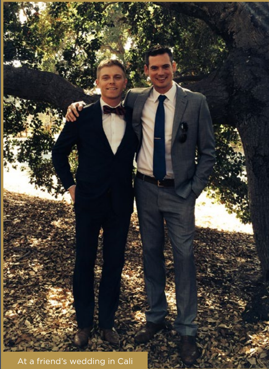
At a friend's wedding in Cali