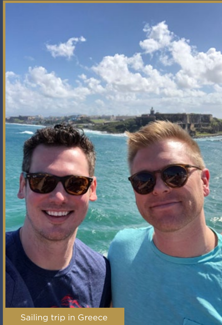
Sailing trip in Greece