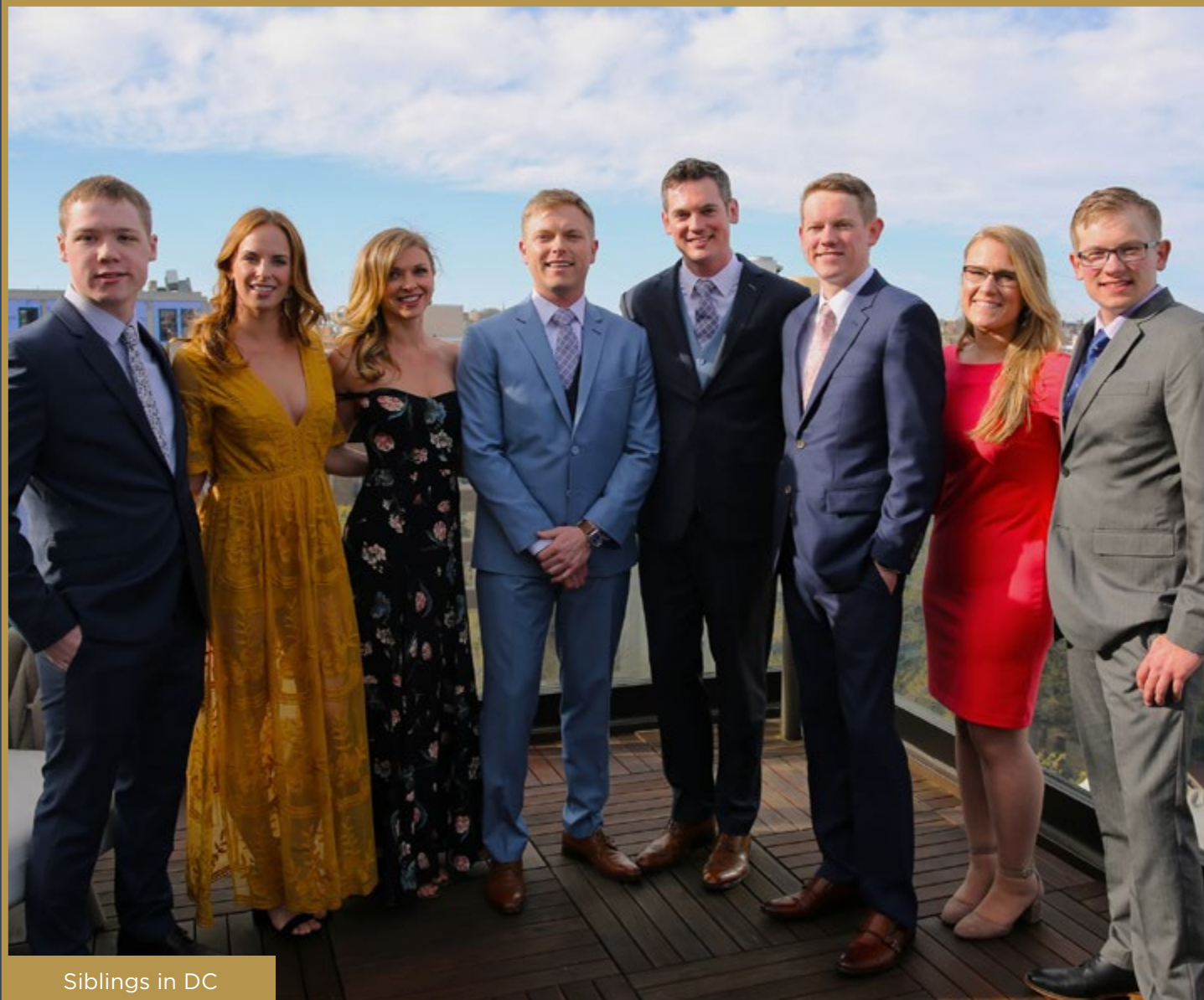
Siblings in DC

We really love to visit and spend time with our family. We host everyone at the lake house in the summer, and we gather together for all the big holidays. We also travel together for lots of fun adventures, like hiking in California, sailing in the Caribbean, skiing in Colorado, and even visiting glaciers in Alaska. We always try to plan at least one big family trip every year!