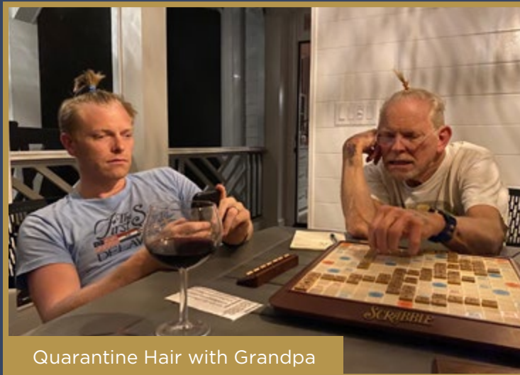
Quarantine Hair with Grandpa