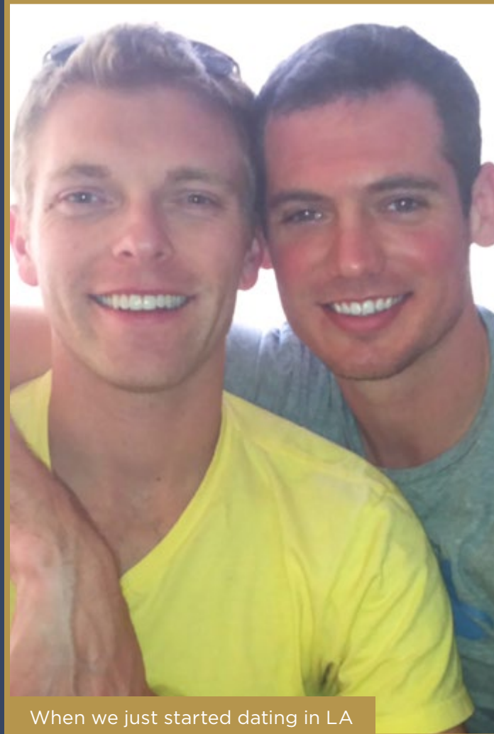
When we just started dating in LA