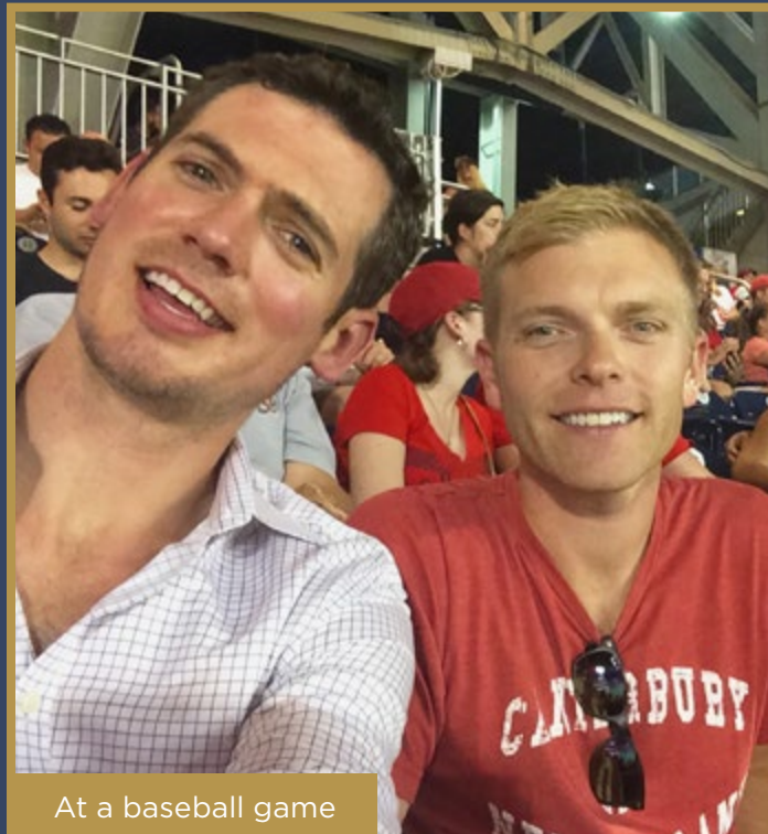
At a baseball game