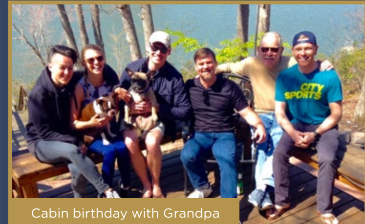
Cabin birthday with Grandpa