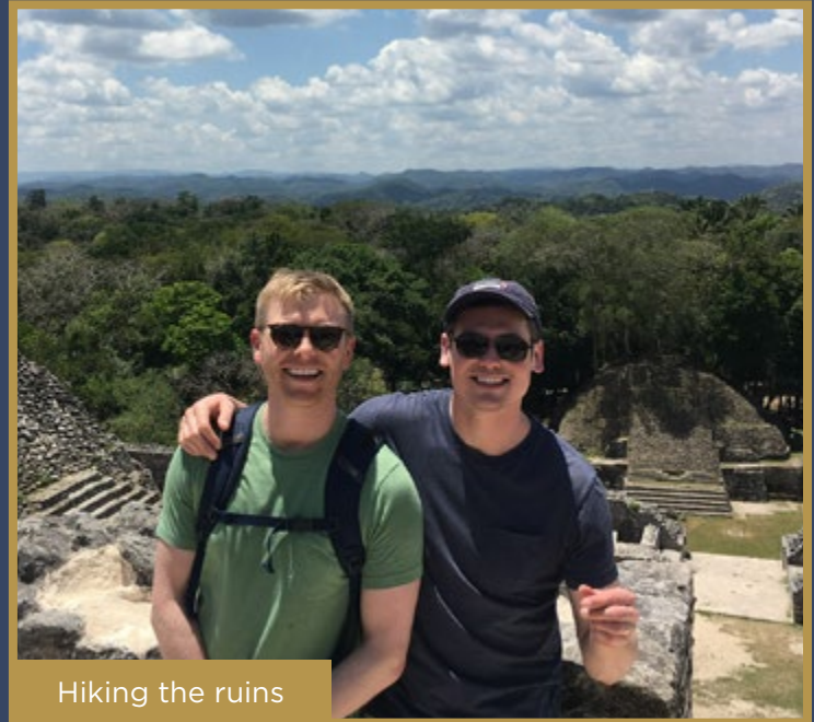
Hiking the ruins