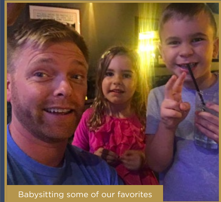
Babysitting some of our favorites