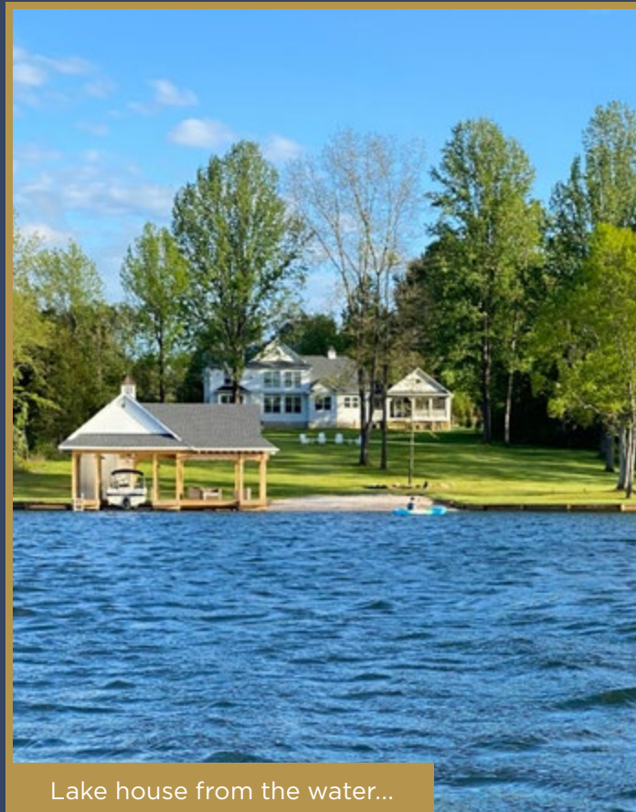
Lake house from the water...