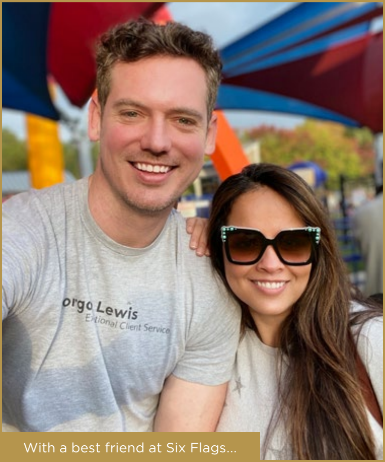
With a best friend at Six Flags...