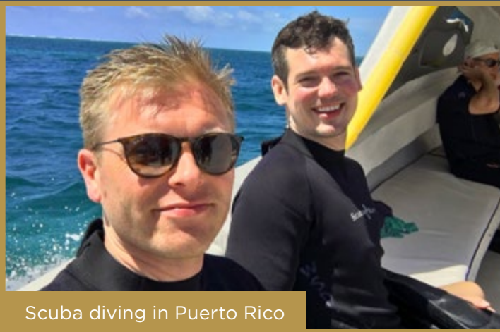
Scuba diving in Puerto Rico