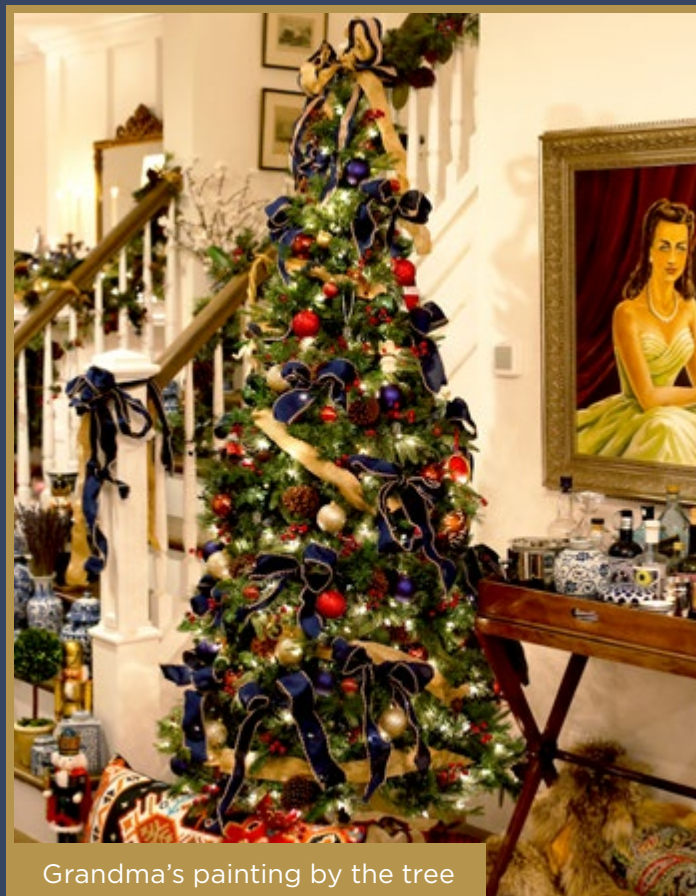
Grandma's painting by the tree