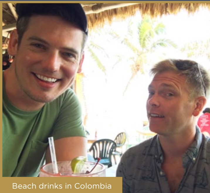
Beach drinks in Colombia