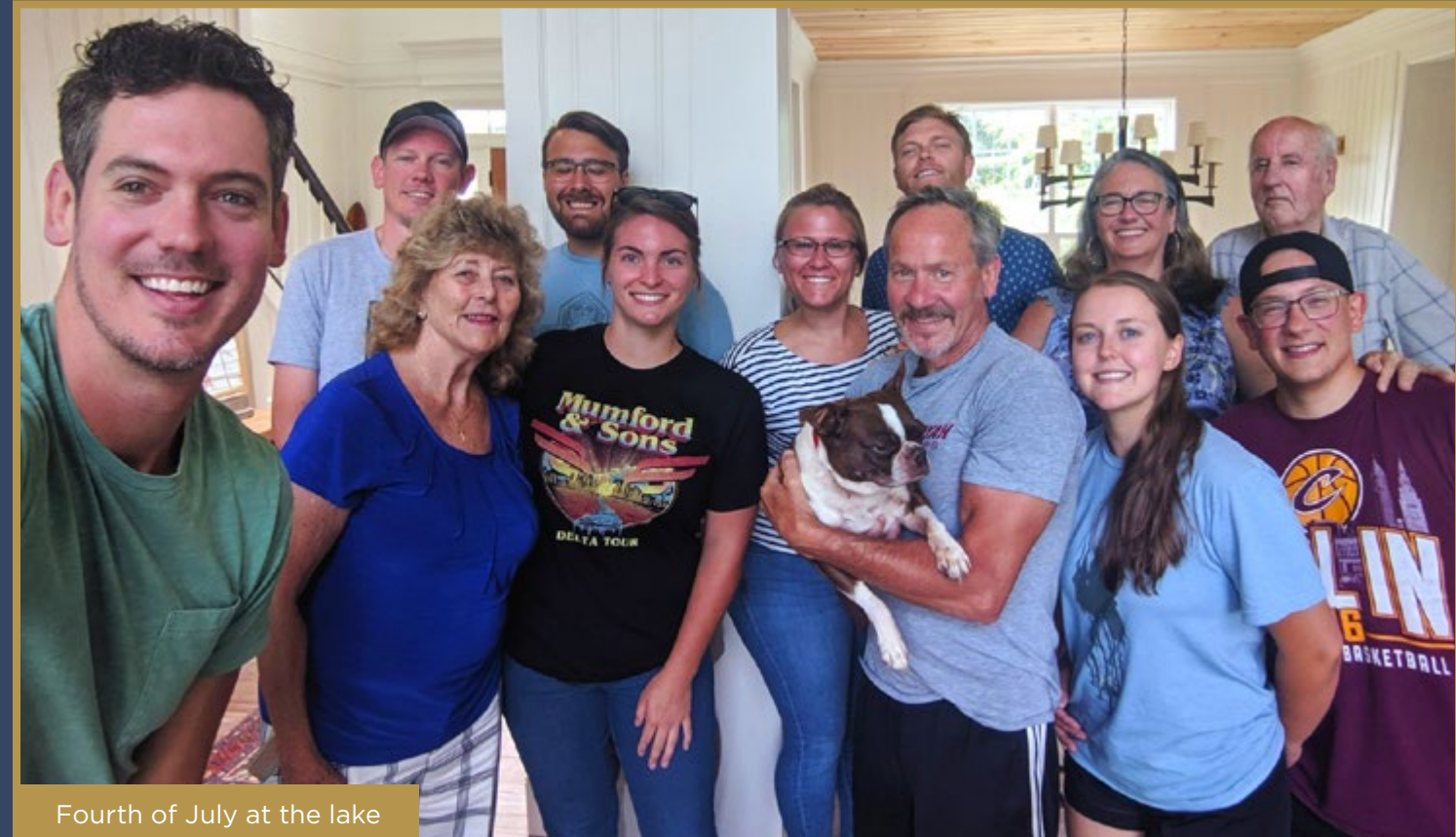
Fourth of July at the lake