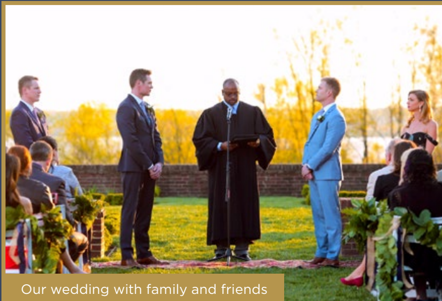
Our wedding with family and friends