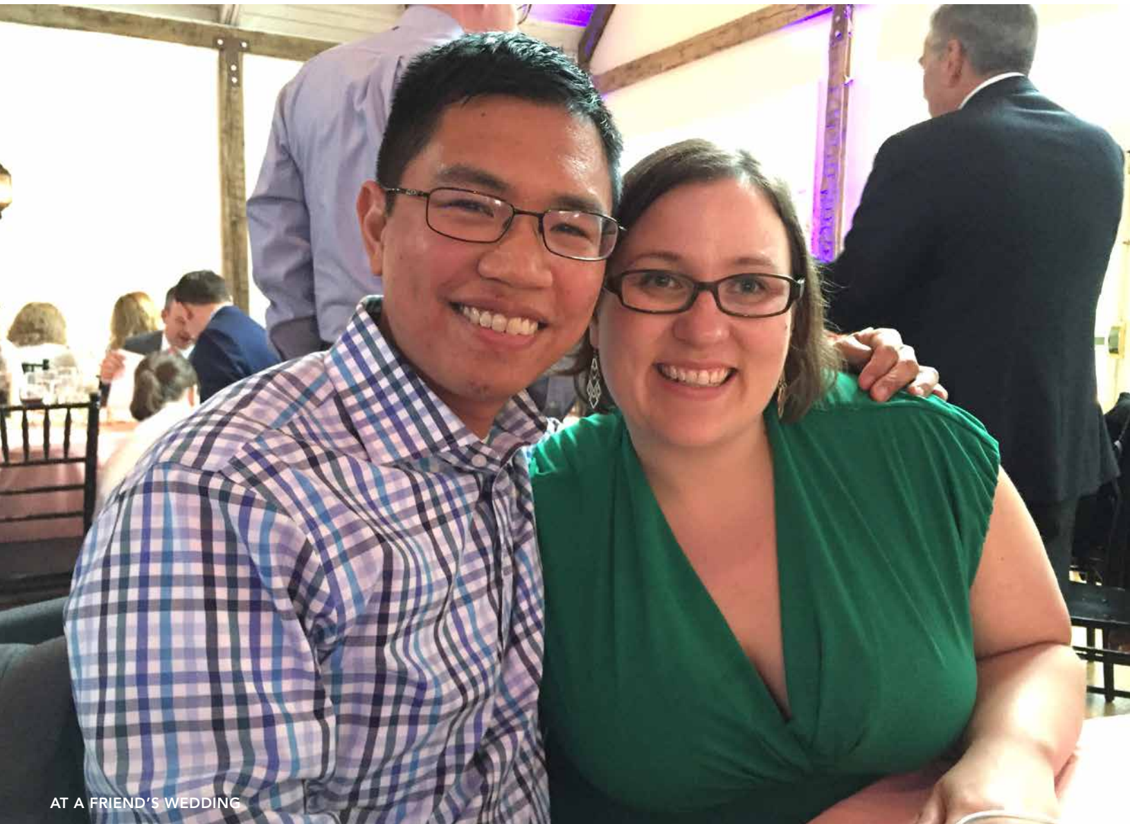
AT A FRIEND'S WEDDING

OVERALL, WE PROMISE TO PARENT WITH THE GOAL OF A CHILD BECOMING A CARING AND THOUGHTFUL ADULT.