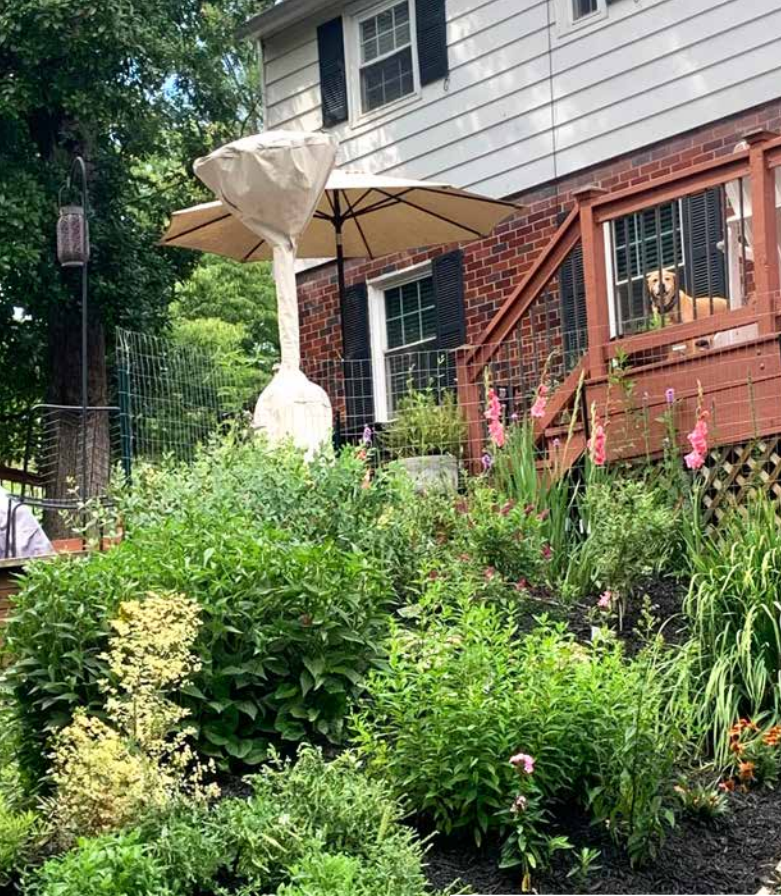
KATE'S BUTTERFLY GARDEN IN OUR BACK YARD

We love the location of our community. We are a 15-minute metro ride away from the National Mall and the Smithsonian museums, making exploring the latest museum exhibit or taking in a theater show a regular activity for us.