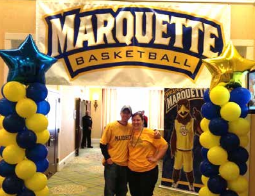
SHOWING OUR MARQUETTE SPIRIT AT AN ALUMNI EVENT