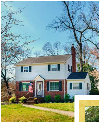
HOME SWEET HOME

Our town is a warm, welcoming and diverse community, with many of the neighbors who came to welcome us during our first weekend here becoming good friends over the years. There are block parties, playgroups, holiday-themed parades, and town celebrations that bring everyone together regularly.