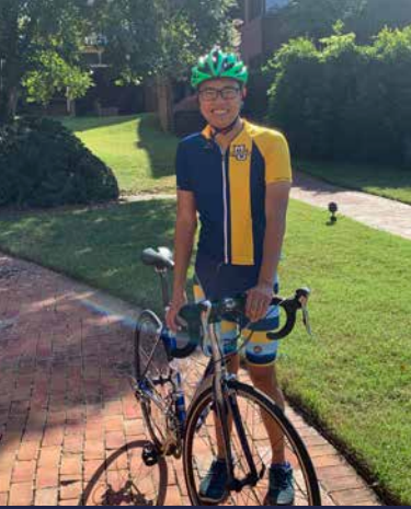
HEADING OUT FOR A RIDE