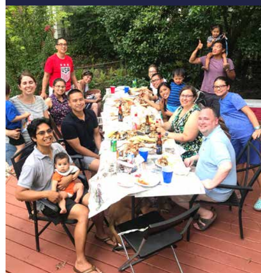
FAMILY CRAB FEAST ON OUR DECK