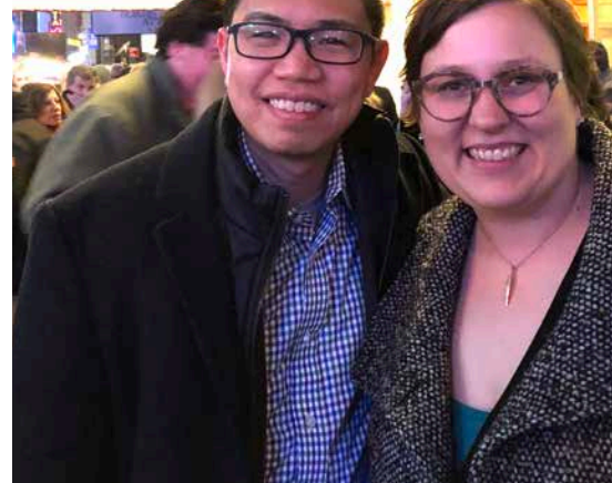
A BROADWAY WEEKEND IN NYC!