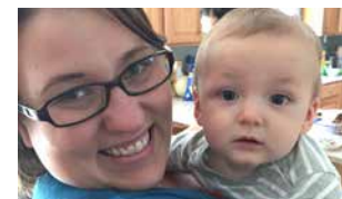
SNUGGLES WITH AUNT KATE