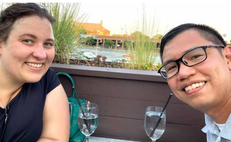
DATE NIGHT IN DC