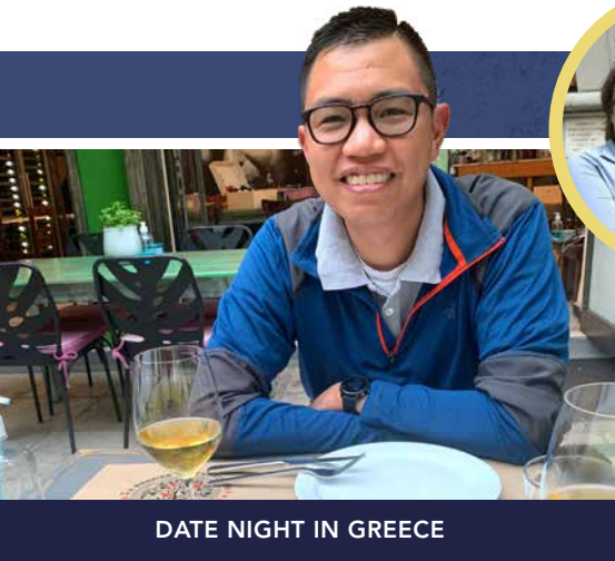
DATE NIGHT IN GREECE