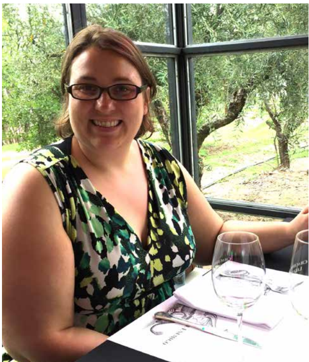
LUNCH IN MENDOZA, ARGENTINA

My friends say I had a magical midwestern childhood, growing up the youngest of three kids on our family farm in Illinois. My most frequent babysitters were my grandparents, and summers were spent at county fairs with my extended family.