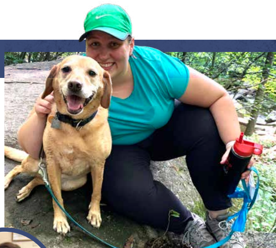
WATER BREAK DURING A HIKE

For me, that meant leaning into my love of learning and exploring by studying abroad in college and living in Japan for two years as a high school English teacher. Travel continues to be a large part of my life, having visited over 30 countries, and I can't wait to travel the world with a child!