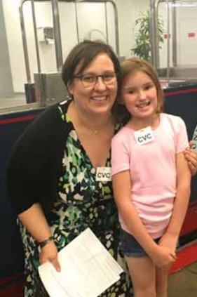
A DC TRIP WITH OUR NIECE FROM ILLINOIS