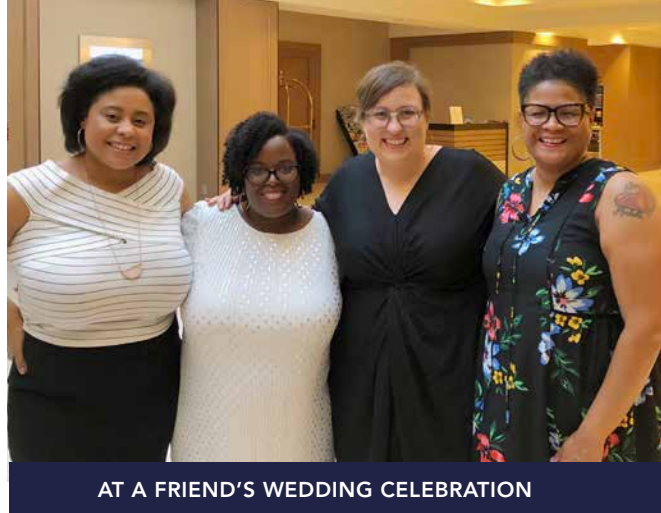
AT A FRIEND'S WEDDING CELEBRATION