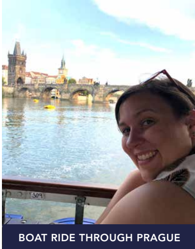
BOAT RIDE THROUGH PRAGUE