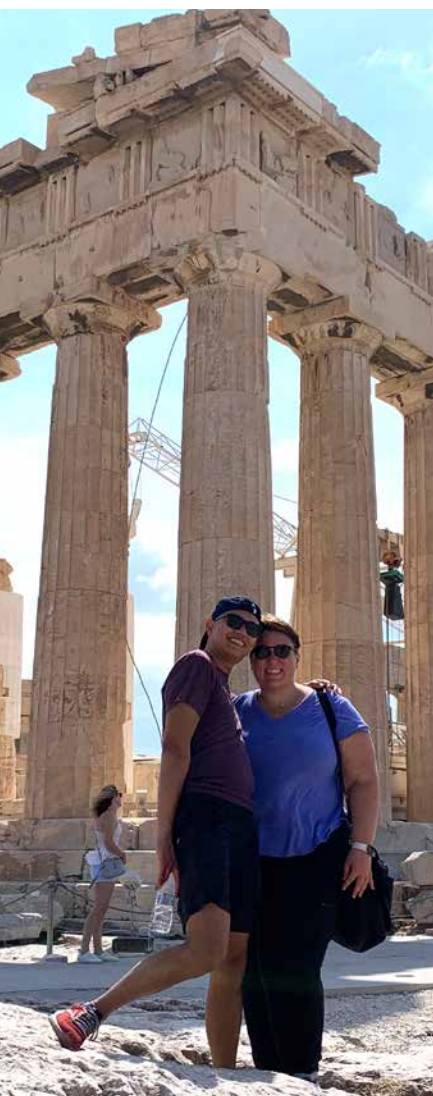
TOURING THE PARTHENON IN ATHENS, GREECE