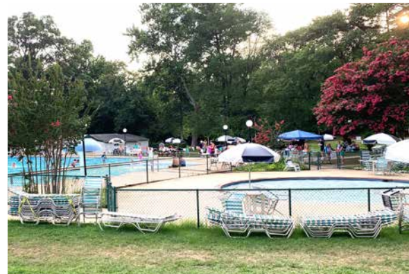
OUR COMMUNITY POOL