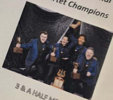
3 & A HALF MEN