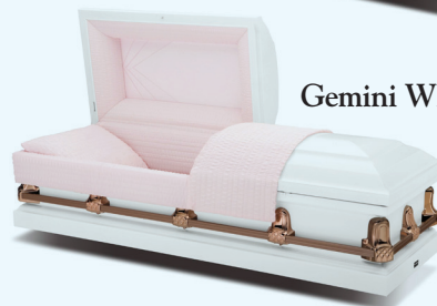
Gemini White Pink

Images depict interior and exterior. Full open caskets are provided.