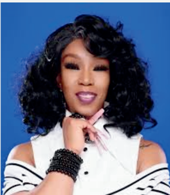
Lacey Britt Taylor Guardian Angel Award