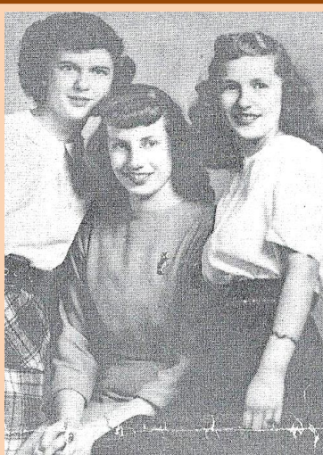
Christmas Queen & Attendants

Exercise—to build strong bodies, which is just as important as strong minds.