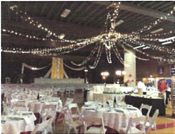
Four Eagle Reception in Social Center Gym

To whom much has been given much is expected. Now we must demonstrate our faith in ways which reflect the wonderful gifts shared with us on May 15, 2014. Now we must not hide our light under a bushel basket! We must be the lights of the world! We must not be afraid to share the WORD with our friends, neighbors, families and whole world! Can we do it! Of course! With God on our side we can work wonders!