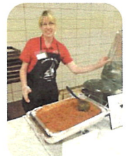
Pam's "Clean Sweep Chili"