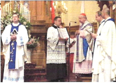
May 15, 2014