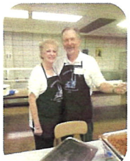
Class of '64 Chefs