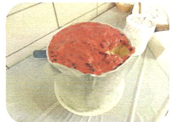
"Looks like a Chili Pot" Cake