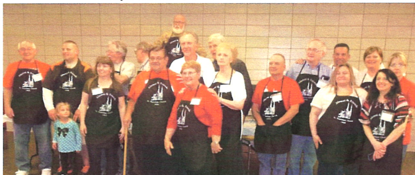
2014 Chili Chefs