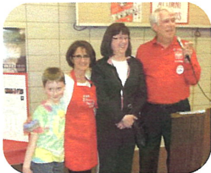
A Happy 'Side Board' Winner