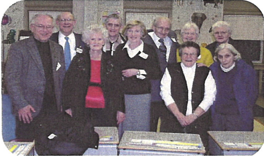
St. Stanislaus Grade School 1944 Classmates together at the 2006 Open House