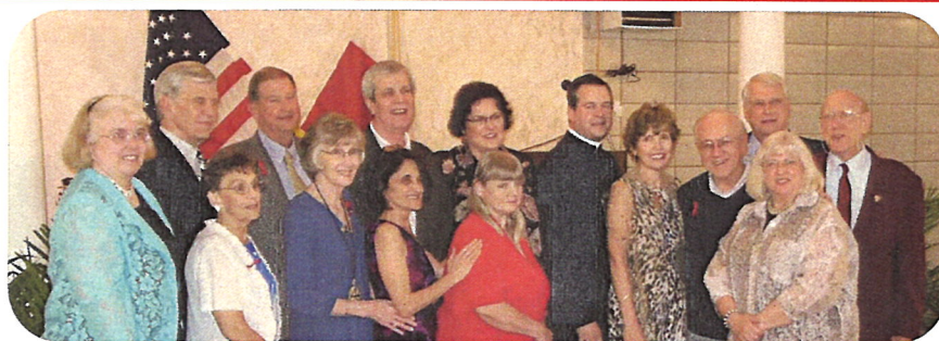
Alumni Committee Members receive Four Eagle Award at May 10, 2013 Ceremony.

Inscribed on the medal presented to the Alumni Committee