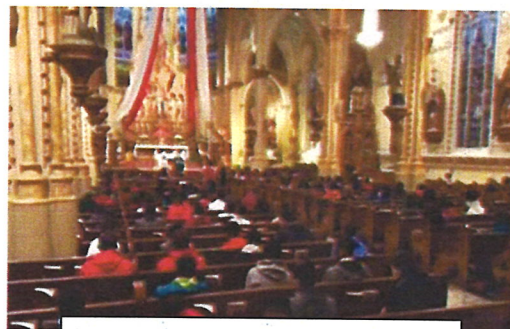
Thursdays Weekly Student Mass