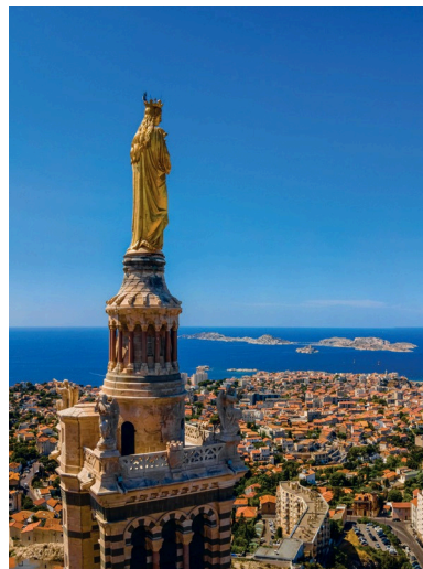
Clockwise Marseille, France Barcelona, Spain MSC World Europa Valletta, Malta