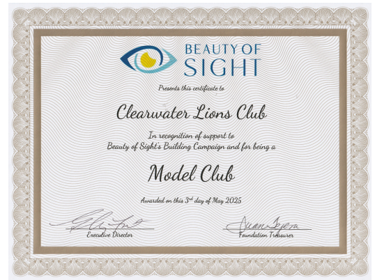
CLC donated $2,700 to the Beauty of Sight Lions Eye Bank associated with the Bascom Palmer Eye Center at the University of Miami. A generous benefactor matched our donation. We are designated as a Model Club because we donated $100 per member and CLC is recognized in the foyer with other MD35 Lions Clubs!