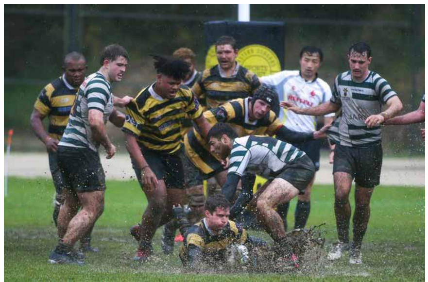
In the wet against OBU.