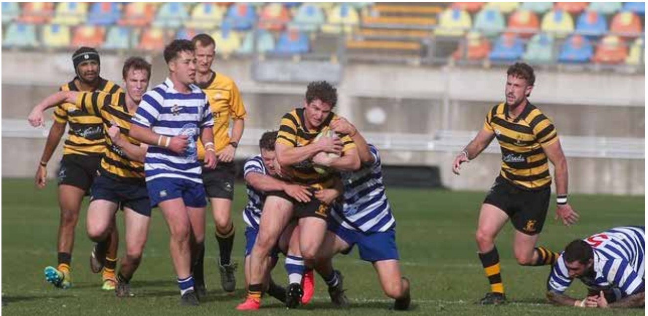
At Yarrow Stadium.

We are team that – despite some of the big scores against us at times – enjoyed each other's company and enjoyed a beer or two after the game and that is what rugby is all about.