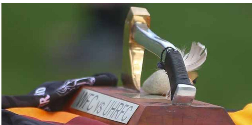
The Hinaki Mei Axe.