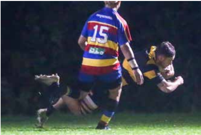
Try vs Tawa.

With good numbers and enthusiasm aplenty, the signs are good for 2024 when we hope to have all these lads back, and a few more as well. They were a young team and battled above their ages so with this valuable experience behind them, it's onwards and upwards.