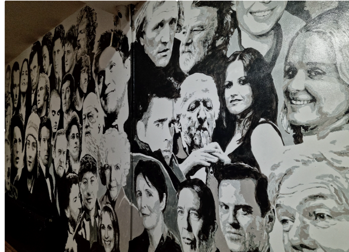
Detail of mural By XXx at the Centre

At the heart of the building is its 378-seat theatre, which has hosted a broad and ambitious programme of work. Each year, the venue presents over 150 events spanning theatre, music, dance, comedy, musicals, and theatre-in-education. In line with national arts policy, Mullingar Arts Centre has grown beyond a traditional receiving house, increasingly supporting the development and presentation of original and collaborative work.