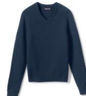
+NAVY SWEATER OR SWEATER VEST