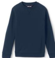
+ NAVY SWEATSHIRT