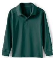
*+ GREEN POLO LONG OR SHORT SLEEVED