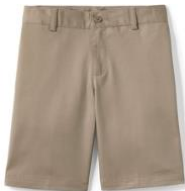
+ KHAKI SHORTS