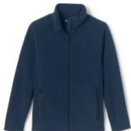
+ NAVY FLEECE JACKET OR FLEECE VEST