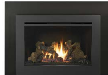
1 Piece Panel - Times Square Face