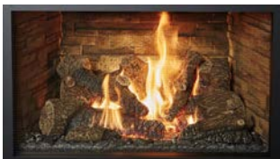
Ledgestone (DVL Only)

When used in conjunction with the accent lighting shadows or reflections can appear on the fireback liner, this is even effective when the fire is turned off! If no liner is selected then the finish is black painted.