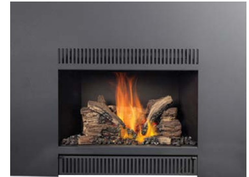
Universal Face - Large