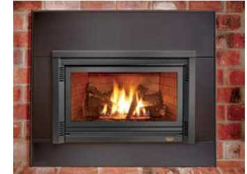
Bottom panel To finish fireplaces that are elevated. This panel will cover up to 177mm below the insert (3 Piece Panel)