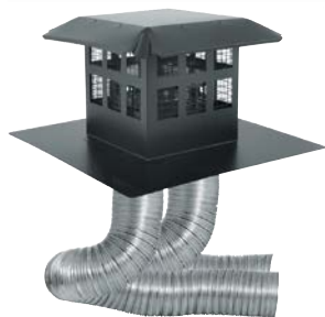
Flexible pipes are installed in your chimney and connect to a chimney termination seen left.