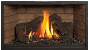
Straight / Herringbone Brick