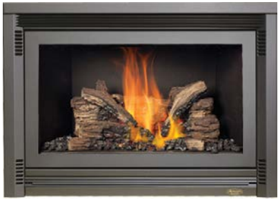
Rosario Face Black Door

A face is required for your Lopi insert, choose from the designs featured below: