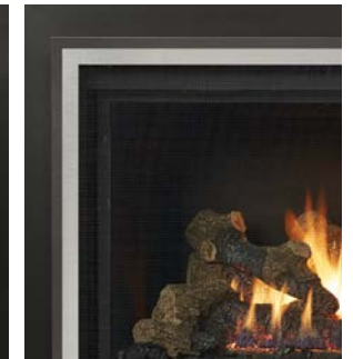
Profile Face Stainless Steel