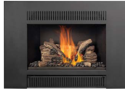
Universal Face - Small