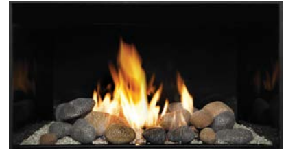
Dancing-Fyre™ Fyre-Stone Rock™