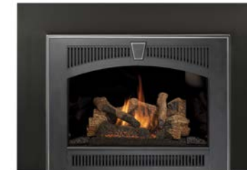
1 Piece Panel - Wilmington Face