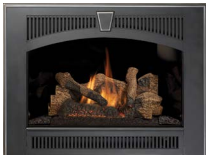
Wilmington Carbon Patina (Also available in black)