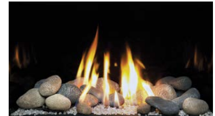
Dancing-Fyre™ Fyre-Stone Rock™