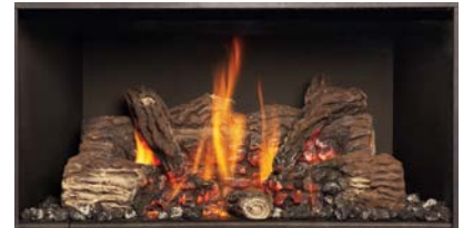
Dancing-Fyre™ Traditional Log