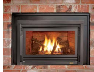
Can be modified to fit inside original fireplace (3 Piece Panel)

Available in 2 sizes for both the DVS GS2 and DVL GS2 and in a Custom 4 sided format providing coverage of 100mm below the firebox for slightly elevated or raised installations.