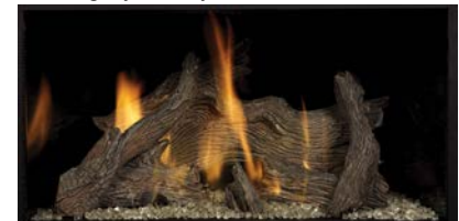
Dancing-Fyre™ Driftwood Fire Art™

** Star rating varies according to flueing configuration Minimum Energy Star Rating of 3.5 Stars with 2.5 metres of flue, and up to the equivalent of 5 Stars with 12.2 metres of flue.