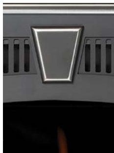
Close-Up Carbon Patina Edge Detail