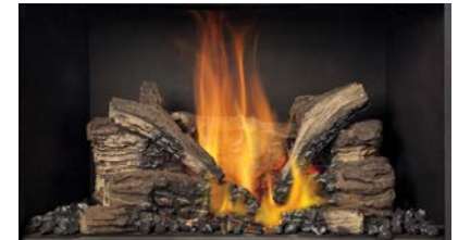
Dancing-Fyre™ Traditional Log