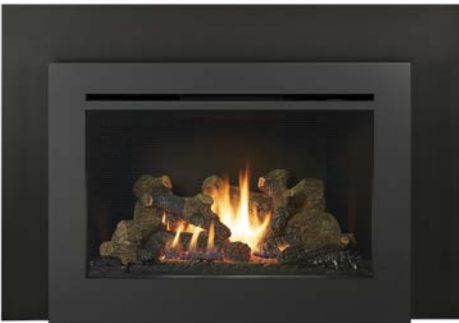
Times Square™ Face