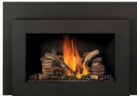
Shadowbox™ Face Black