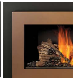
Shadowbox™ Face Bronze