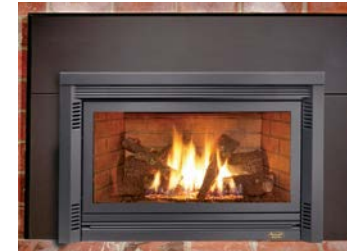
Available in 3 Sizes, Can be cut down to suit opening (3 Piece Panel)