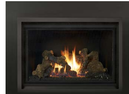
Profile Face Black