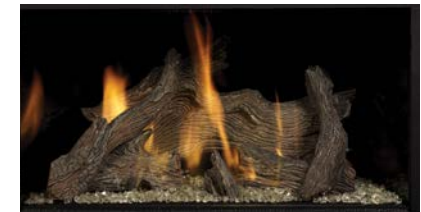
Dancing-Fyre™ Driftwood Fire Art™