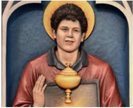
ST CARLOS ACUTIS

BEATIFIED BY THE CATHOLIC CHURCH IN 2020, HE IS REGARDED AS A MODEL FOR YOUNG BELIEVERS AND WAS CANONIZED AS A SAINT ON SEPTEMBER 7TH 2025.