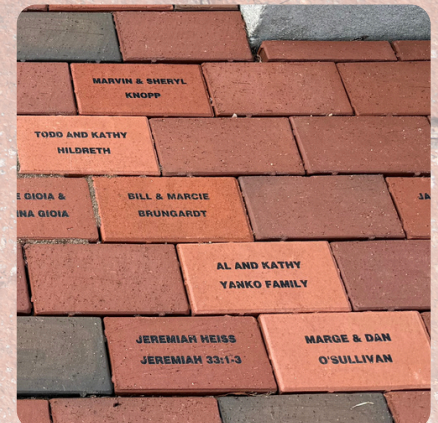
Memorial Flag Pole