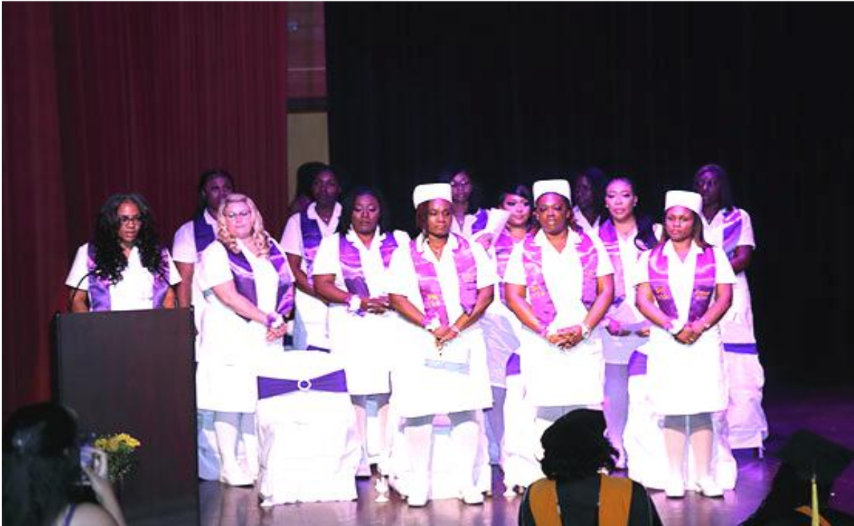
CAAN Academy of Nursing 20 th Capping & Pinning Ceremony at Freedom Hall in Park Forest, IL

If you are interested in participating in local, state or national elections, please visit the Election Assistance Commission website at http://www.eac.gov/voter_resources/register_to_vote.aspx to learn how you can register to vote.