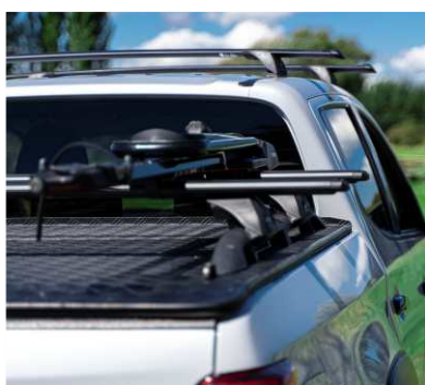
TIE DOWN RAILS