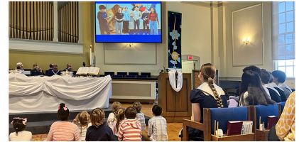
Looking Back As They Looked Ahead All six Confirmands sat eagerly absorbed in an inspiring, enlightening and occasionally funny video — lovingly crafted by Mrs. B — that recapped some of the special moments they shared on the road to church membership.