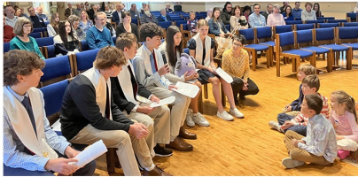
Passing Down the Light of Faith In a special intergenerational Children's Time , our about-to-be-confirmed "Bigs" sat across from our anxious-to-know-more "Littles" and previewed for them the personal faith journey that they too may one day take.