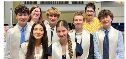
Friends and Fond Memories The benefits and rewards that participants in a shared experience like Confirmation Boot Camp gain — things like closer friendships, heightened awareness of your values and deeper, stronger faith — will be with them for a lifetime.