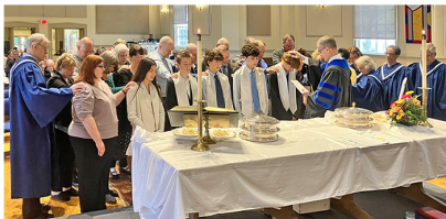
Have Faith, We Have Your Backs OPPC members who have been ordained to serve as Elders or Deacons came forward for the traditional "Laying on of Hands," welcoming the new members and pledging to support them throughout their spiritual journey.