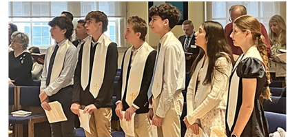
In Search of Spiritual Meaning Just as they had studied and learned together during Boot Camp, the six young, determined Confirmands stood again as one in preparation for becoming members of our faith community.