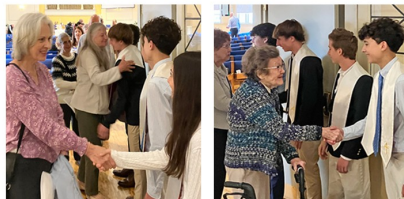
Congratulations and Blessings As congregants departed worship on April 19th, they took time to stop and individually greet OPPC's 2026 Confirmands, offering them their heartfelt encouragement to actively embrace and explore the power of their faith.