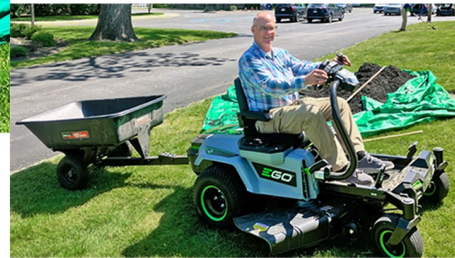
Release the Mulch Mobilization Man! Dedicated Dan-driven dirt delivery at your service.