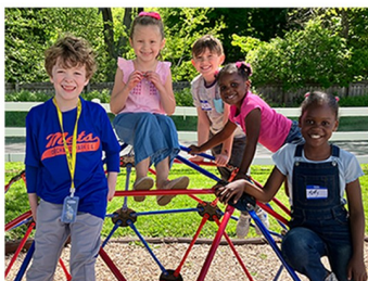
Sitting on Top of the World That's where the "Littles" that our church family cherishes so dearly were, playing joyfully while the rest of us adultly worked equally joyfully.