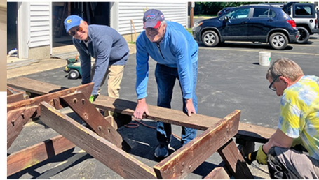
These Guys Were Benched... But in a Good Way It certainly is handy to have handy people handy.