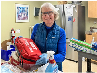
Is There a Dr. in the House Kitchen?! A little TLC for our First Aid resources.