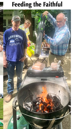
Feeding the Faithful