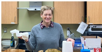
All-Purpose MVP Bats Cleanup The Kitchen is always a P-R-E hot spot!