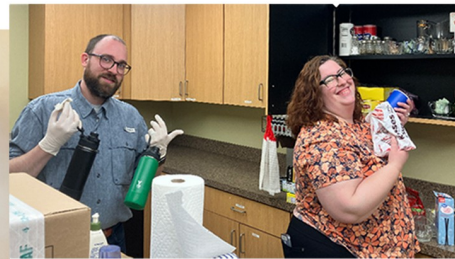
Couples Cleaning Therapy Teamwork really does make the dream work!