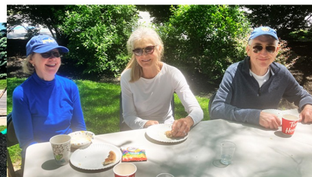
Food, Family and Fun for Everyone Post-worship fellowship fosters faithful friendships!