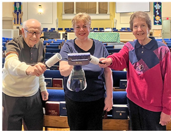
The Three Dustkateers All for one and one for all cleaned up!