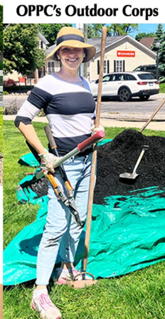
OPPC's Outdoor Corps