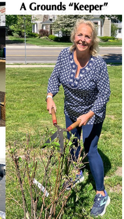
A Grounds "Keeper"