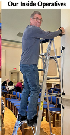
Our Inside Operatives