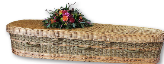
Elite Seagrass Casket