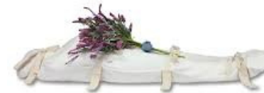
Bamboo Shroud w/ handles