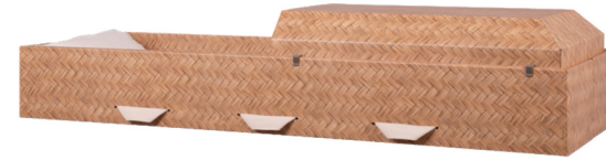
Simple Nature Casket