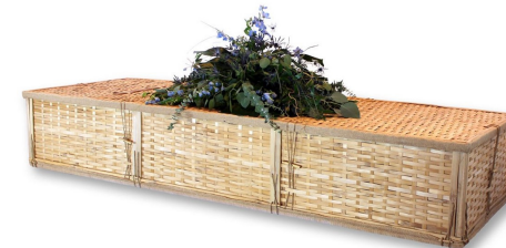
Simple Bamboo Casket