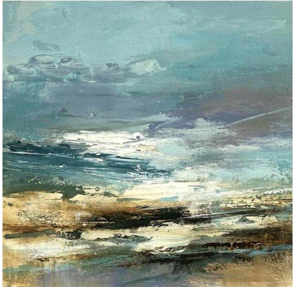
Ocean Green – Acrylic & Mixed Media