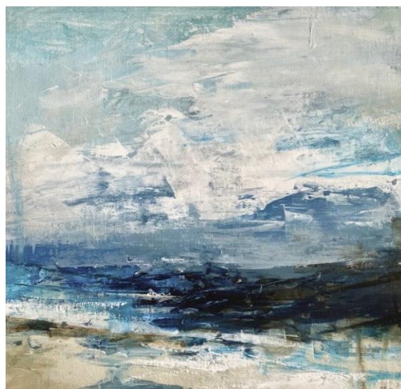
Blue Day – Acrylic & Mixed Media