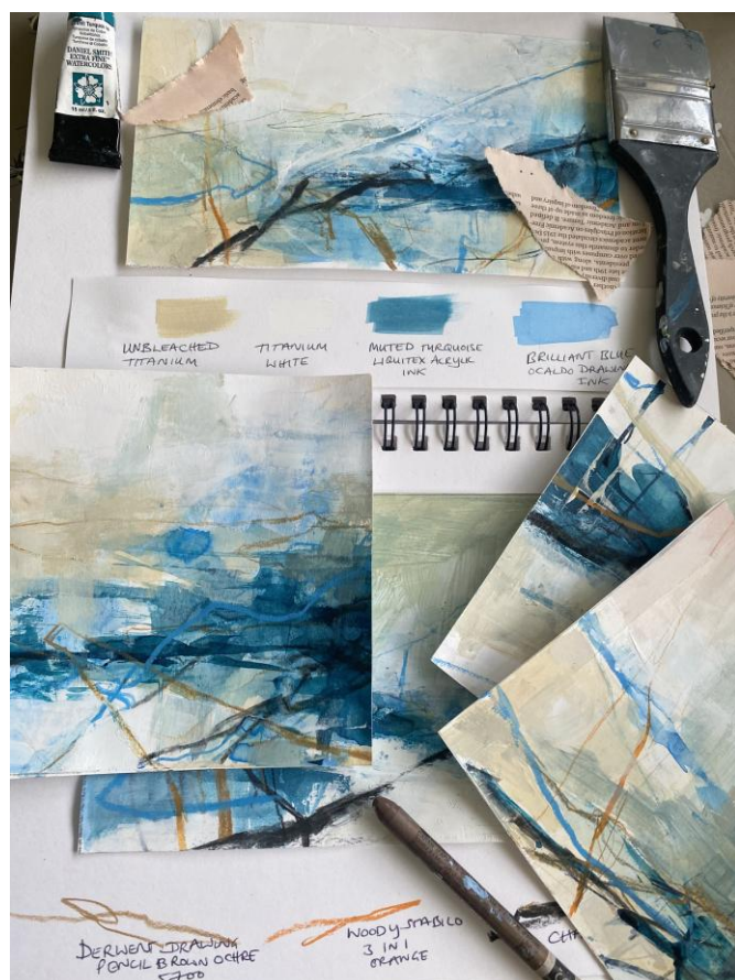
Painting studies and colour notes