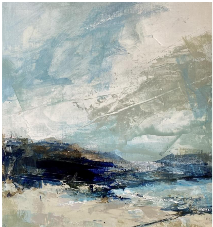
Cornish Cove – Acrylic & Mixed Media