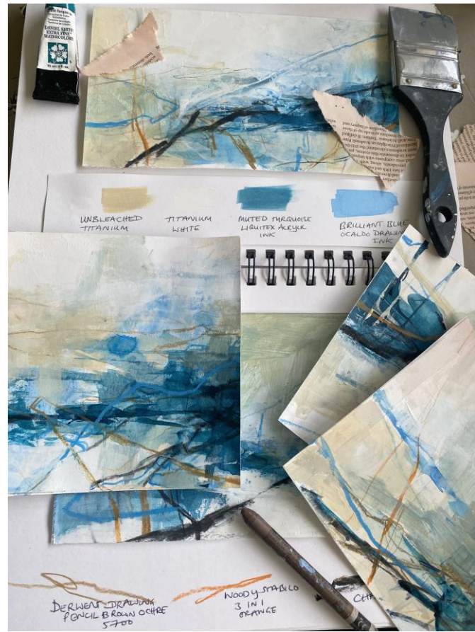
Painting studies and colour notes