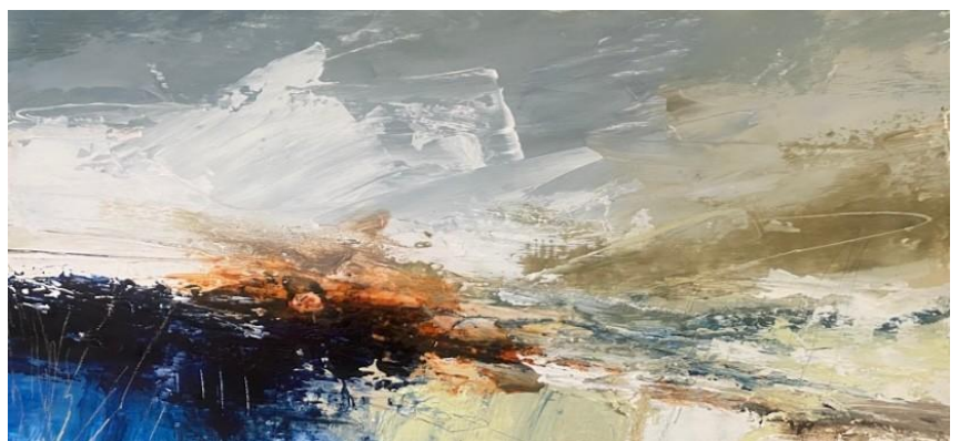
Windy Sky with Orange Glow – Mixed Media – Luisa Holden