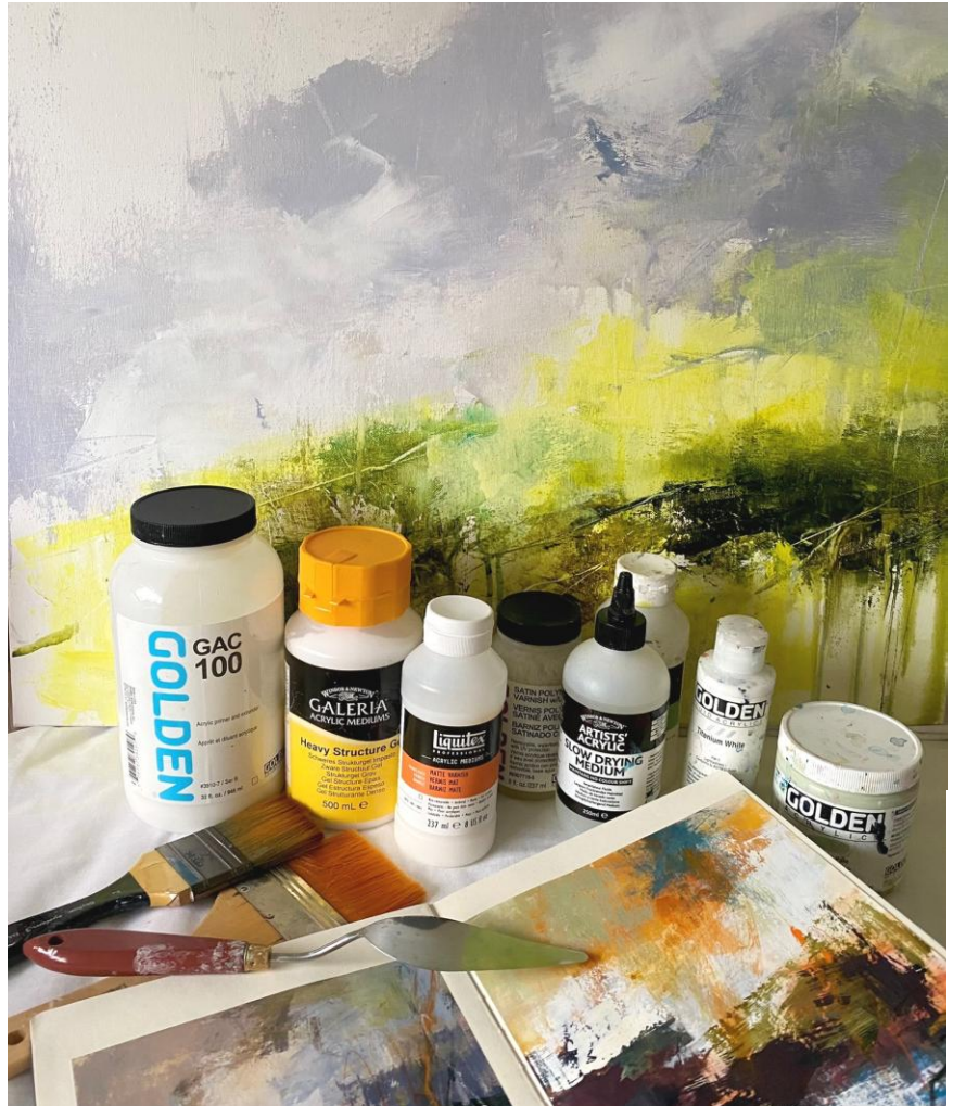
Working sketchbook and selection of mediums.

I will email you full location details and directions. Nantwich is a lovely historical market town, set beside the River Weaver. It has a wide range of speciality shops and one of the finest medieval churches in Britain, St Mary's. It has a train station, good bus links and is close to the M6.