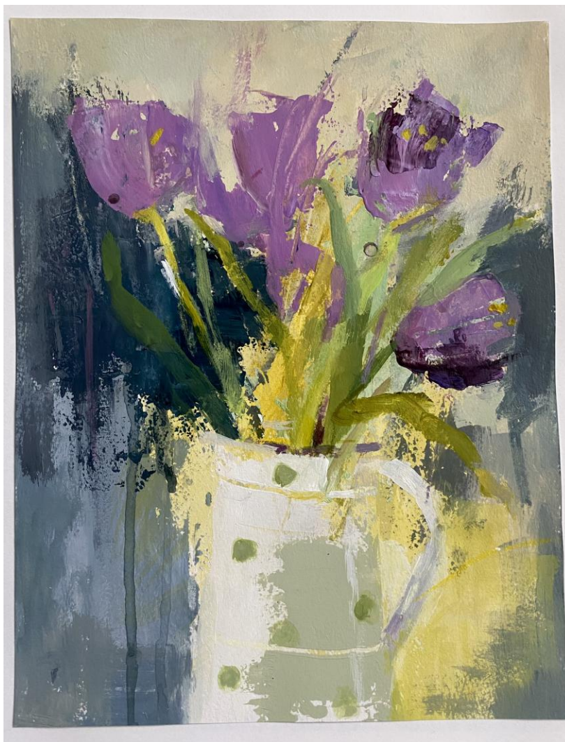
Tulips Study in watercolour & acrylic

I will teach you my process for painting expressive/abstracted flowers using a variety of acrylic brushes and large palette knives. Emphasis will be on capturing the essence and energy of the flowers rather than concentrating too much on detail so students will be encouraged to take risks and be bold with mark making.