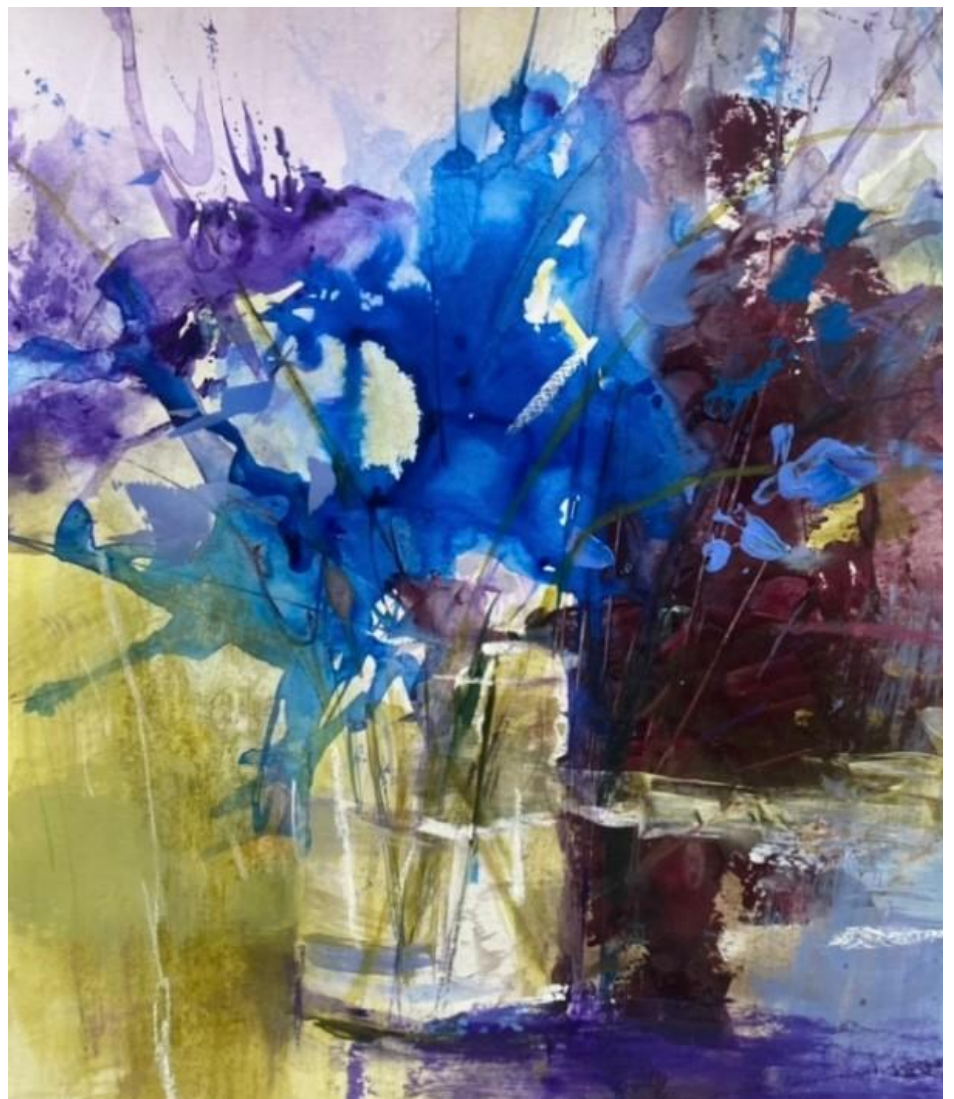
Blue & Purple Posey – Mixed Media