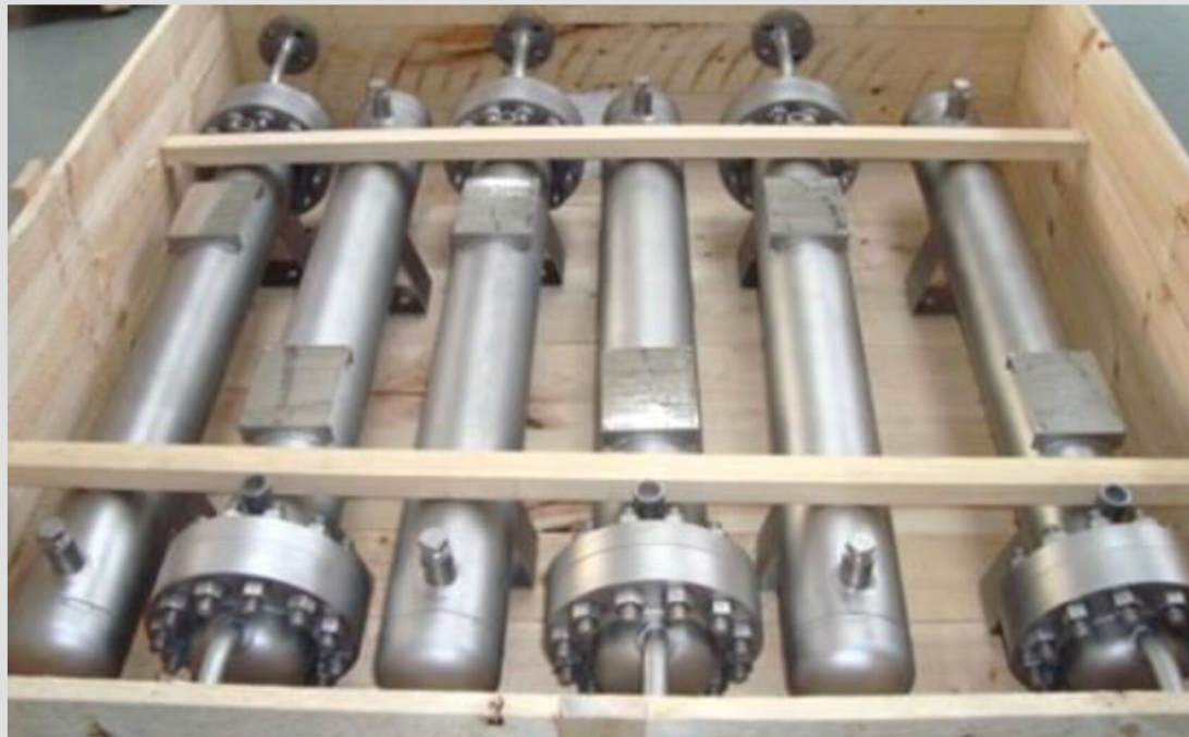
API Plan 21/23