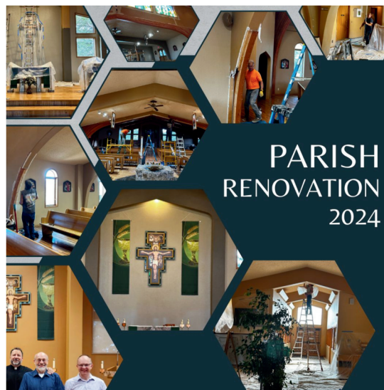
PARISH RENOVATION 2024