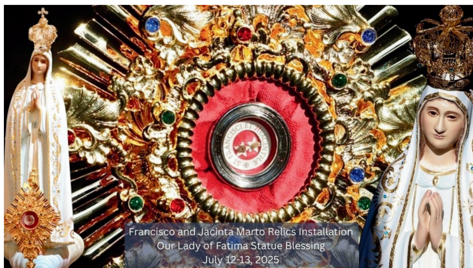
Francisco and Jacinta Marto Relics Installation Our Lady of Fatima Statue Blessing July 12-13, 2025