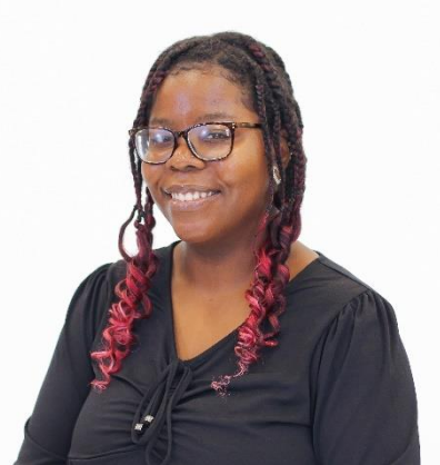
Head shots by professional photographers in Ohio, New Jersey, and Connecticut.