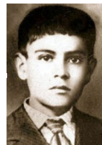
Saint Jose Sanchez del Rio