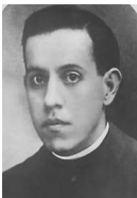
Blessed Father Miguel Pro

In the 1920s during the fierce persecution of the Church in Mexico, when the Church refused to submit to an atheistic government, the faithful boldly declared Christ as their ultimate leader. The fourteen-year-old Saint Jose Sanchez del Rio and Blessed Father Miguel Pro who, went to their deaths defiantly declaring this battle cry "Viva Cristo Rey!" Today, we join them in proclaiming, "Long live Christ the King!"