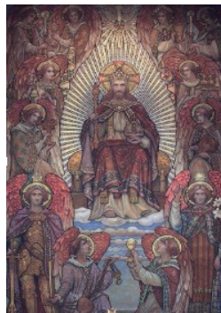
Christ the King