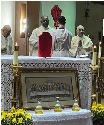
Mass of the Lord's Supper