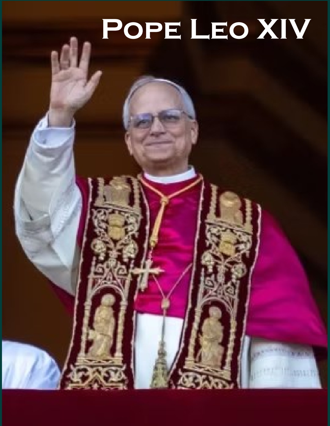
POPE LEO XIV