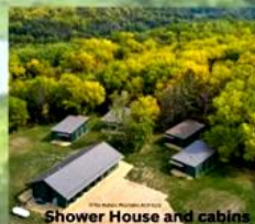
Shower House and cabins