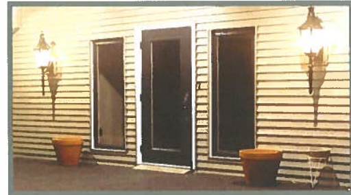
Trimble Funeral Home, Coal Valley

This booklet presents an itemized listing of our service and merchandise offerings. It also lists several packages which offer a simplified way of selecting complete services at a single, discounted price. Our exclusive "Worry-Free Cremation Care"™ is also described in detail.