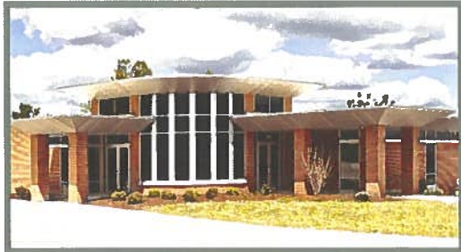
Trimble Funeral Home & Crematory at Trimble Pointe, Moline