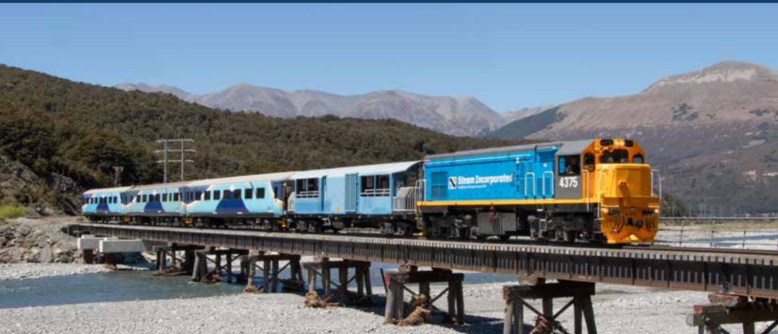
Mainlander Train - Invercargill to Dunedin and Dunedin to Oamaru