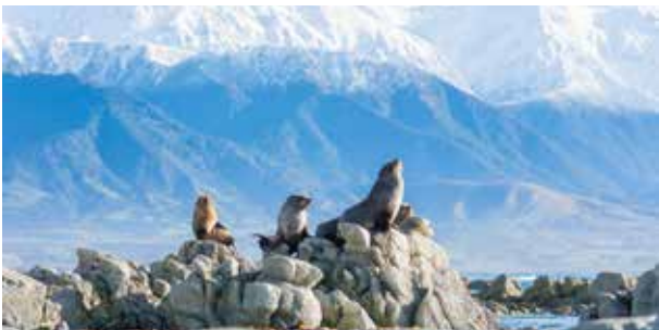
South Island, New Zealand 15-Day Sir Edmund Hillary Explorer Pinnacle Tour

Passengers stay at the Sudima Hotel Kaikōura