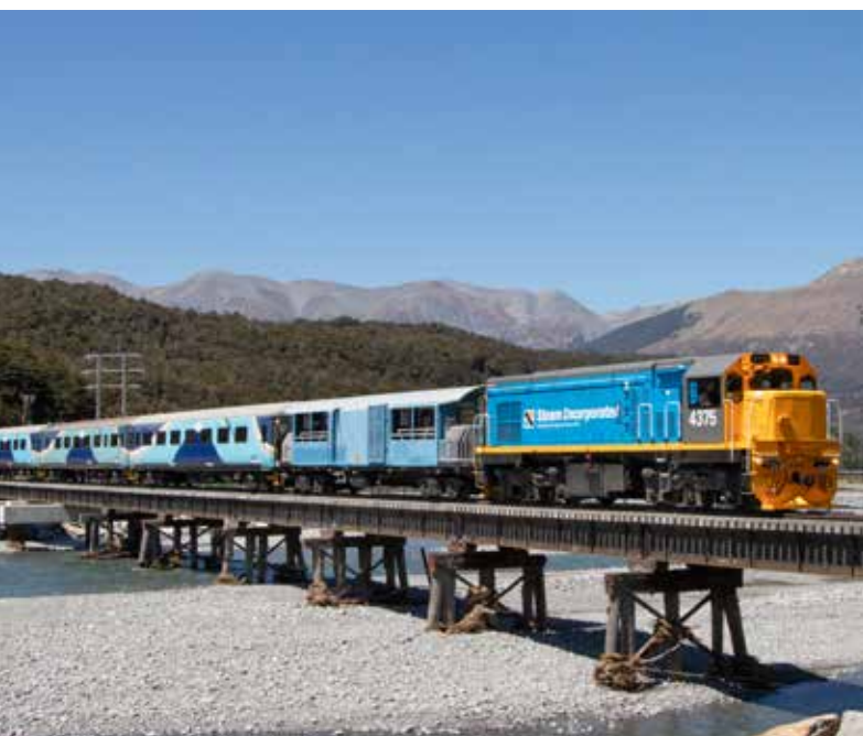
The Mainlander (Invercargill-Dunedin)