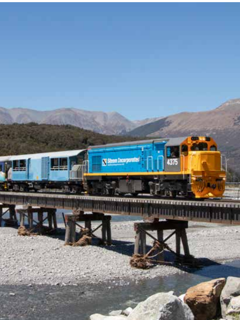
The Mainlander (Invercargill-Dunedin-Oamaru)