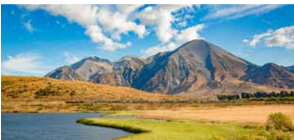
South Island 11-Day Sir Edmund Hillary Explorer

Tour Guests stay at the Scenic Hotel Franz Josef.