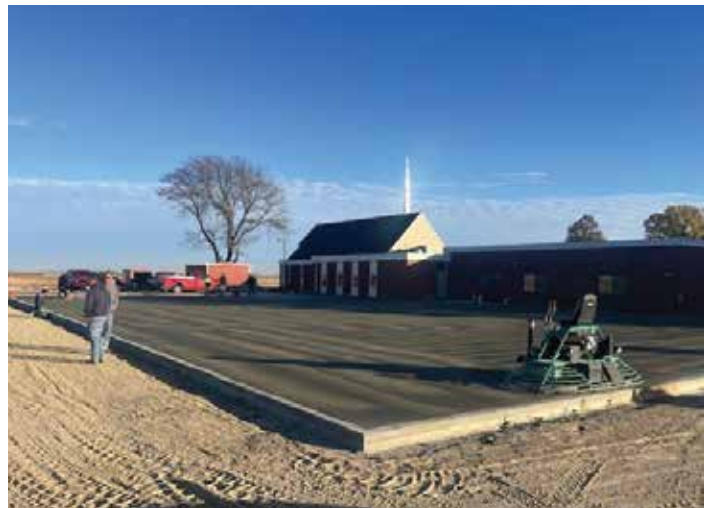
Westmark Church Project in the Loomis Area