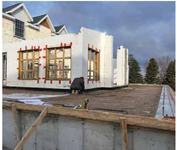
Residential Project with ICF Walls