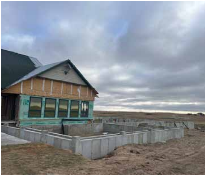
Wildhorse Golf Course Northwest of Gothenburg

I would also like to take the time to thank all our current employees for their hard work this construction year and wish them a happy holiday season.