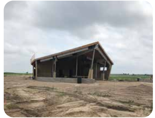
Ogallala Rest Area

As always, continue to work safely, efficiently, and enjoy the warmer weather.