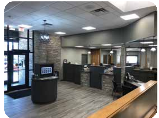
Waypoint Bank in Cambridge