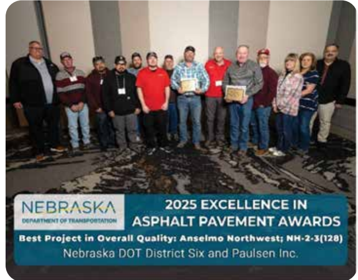
Best Asphalt Project in Overall Quality Anselmo Northwest, NH-2-3(128)