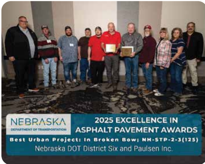
Best Urban Project Broken Bow, NH-STP-2-3(125)

Congratulations on Your Outstanding Work Everyone!