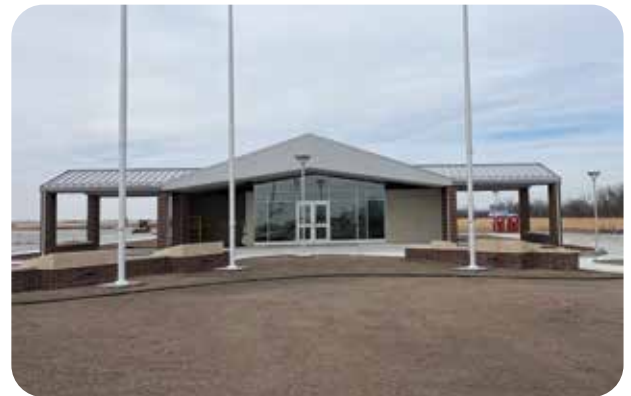
Ogallala West Bound Rest Area

Tim Hemmingson and crew are finishing up the interior work at the Ogallala Westbound Rest Area. Seeding and landscaping work will commence as spring weather approaches. From there, that crew will move back east to complete a scale swap-out at the westbound truck scales east of North Platte. An extensive concrete demolition job was completed earlier, and new scale construction will begin in early March.