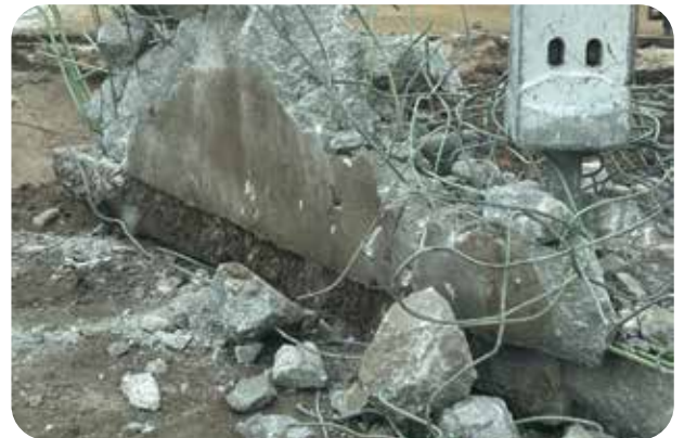
North Platte Scale Demo

Dan Schwarz and crew continue work on a residential project in rural Cozad. The addition is dried in, with sheetrock work starting the first week of March. That crew has also been pitching in to help other crews where needed. They are also continuing demolition work at the Westmark Church in the rural Loomis area. It is planned that this crew will also install the metal roofing and wall panels for the church addition.